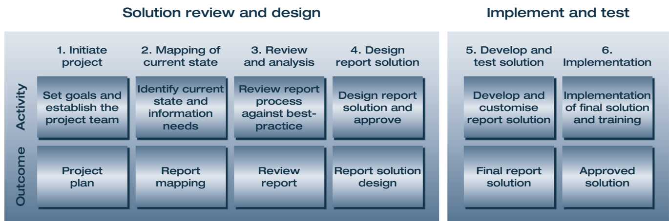
Figure 3. An outline of the Maconomy Business Reporting Methodology

The following illustration provides an overview of the Maconomy business reporting methodology.